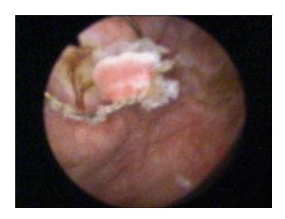
Figure 2 . Appearance of growth in urinary bladder during cystoscopy